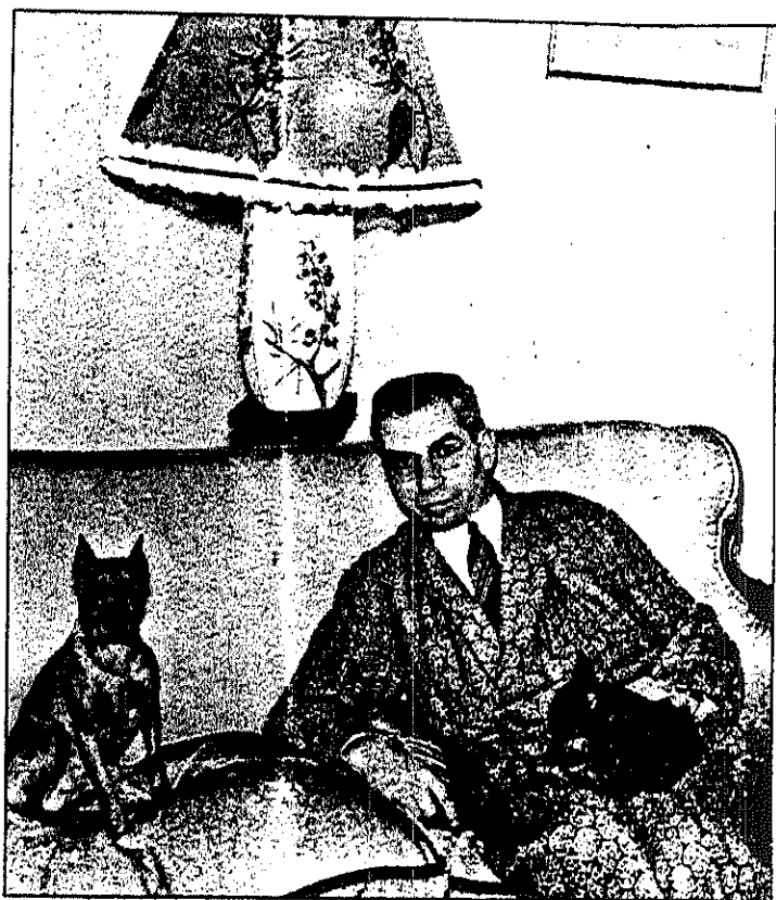
LUCKY LUCIANO , the Mafia's exiled don of dons, expanded the Syndicate's overseas connections with CIA help.

4. Nixon, Rebozo and Smathers may have begun working together as early as World War II. During the early Forties, Smathers was in court defending a client accused of smuggling American-made tires through Cuba and thereby circumventing the tire-rationing laws. When Smathers encountered a delay in the case, he sent a letter to the Office of Price Administration in Washington, where Nixon was a lawyer in the tire-rationing section charged with preventing such profiteering, a job Nixon later chose to cover up in his official Congressional Directory entry. Smathers's father held a similar job on a local rationing board in southern Florida, where Rebozo was the area's top supplier of recapped tires. Investigators have tried—and so far failed—to prove that the trio first met during this period.